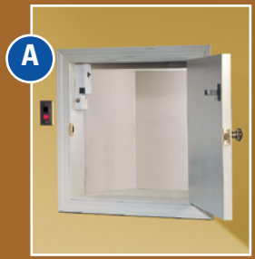
Hoistway Door: Have your builder design and install a custom swing door, or choose a commercial-grade bi-parting, slide-up or swing door (shown on previous page).